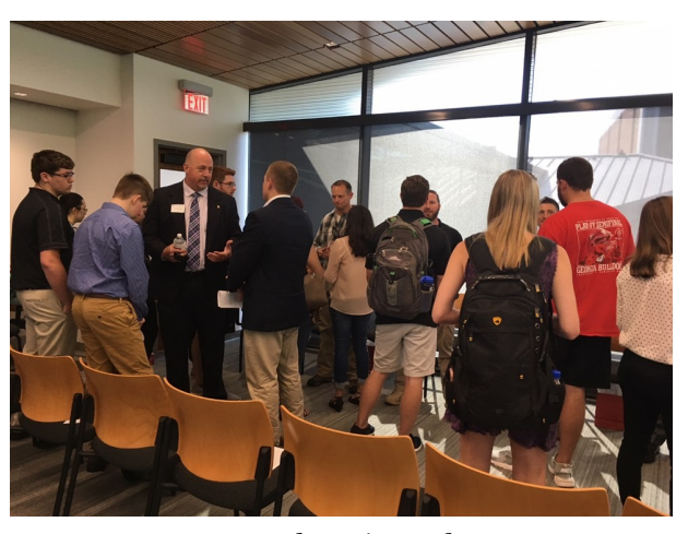
2018 Alumni Panel