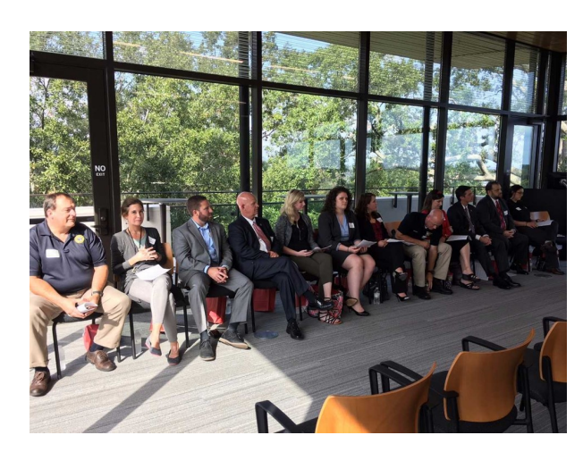
2017 CJSP Alumni Panel

In these photos, we highlight panels from the past two years. As you will see, the renovation of Baldwin Hall allows an opportunity to use a new, beautiful space: the Pinnacle Room. If you have any interest in participating in future panels, please contact Todd Krohn at <a href="mailto:tmkrohn@uga.edu">tmkrohn@uga.edu</a>