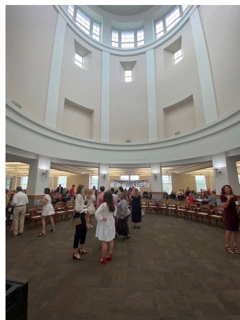
convocation at the Rotunda in the MLC